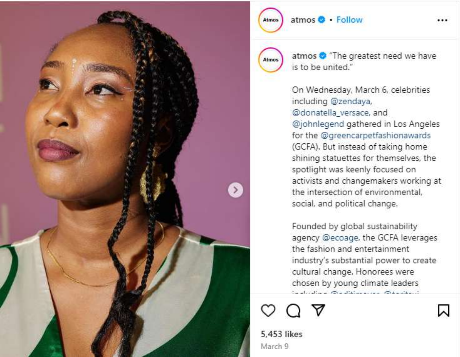
Atmos Climate & Culture Platform 306k Followers